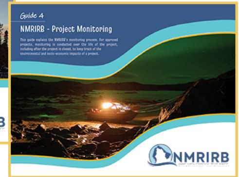
Guide 4: Project Monitoring