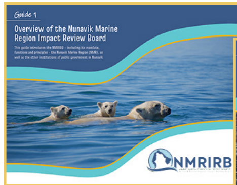
Guide 1: Overview