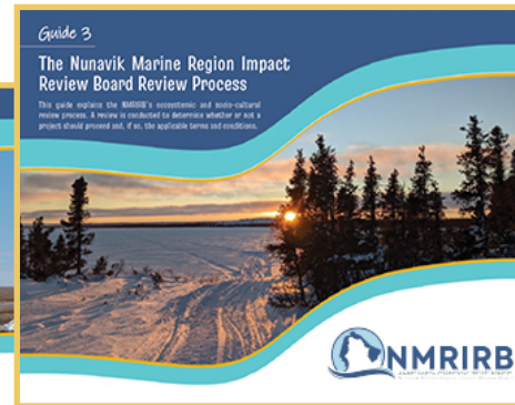
Guide 3: Review Process